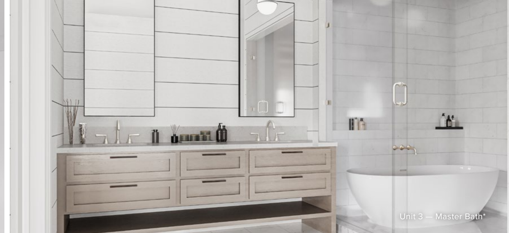
Unit 3 — Master Bath*