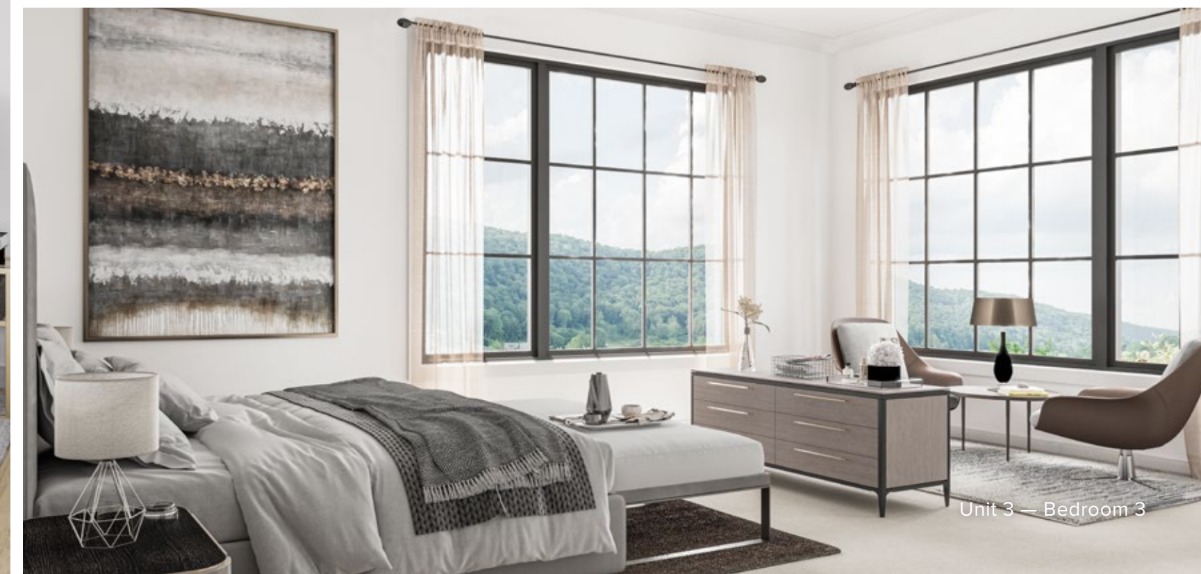
Unit 3 — Bedroom 3