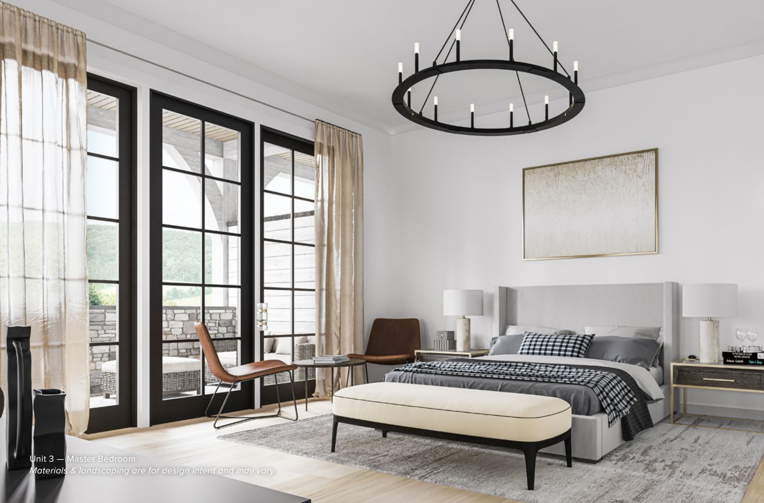
Unit 3 — Master Bedroom Materials & landscaping are for design intent and may vary