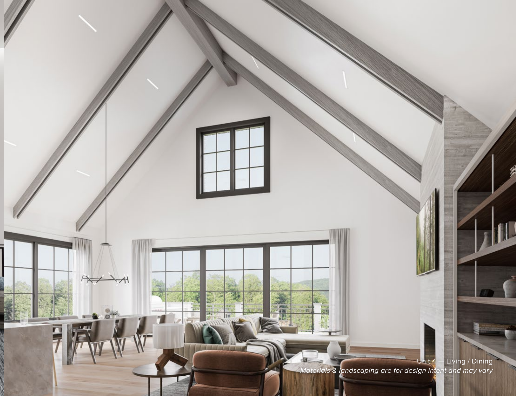
Unit 4 — Living / Dining Materials & landscaping are for design intent and may vary