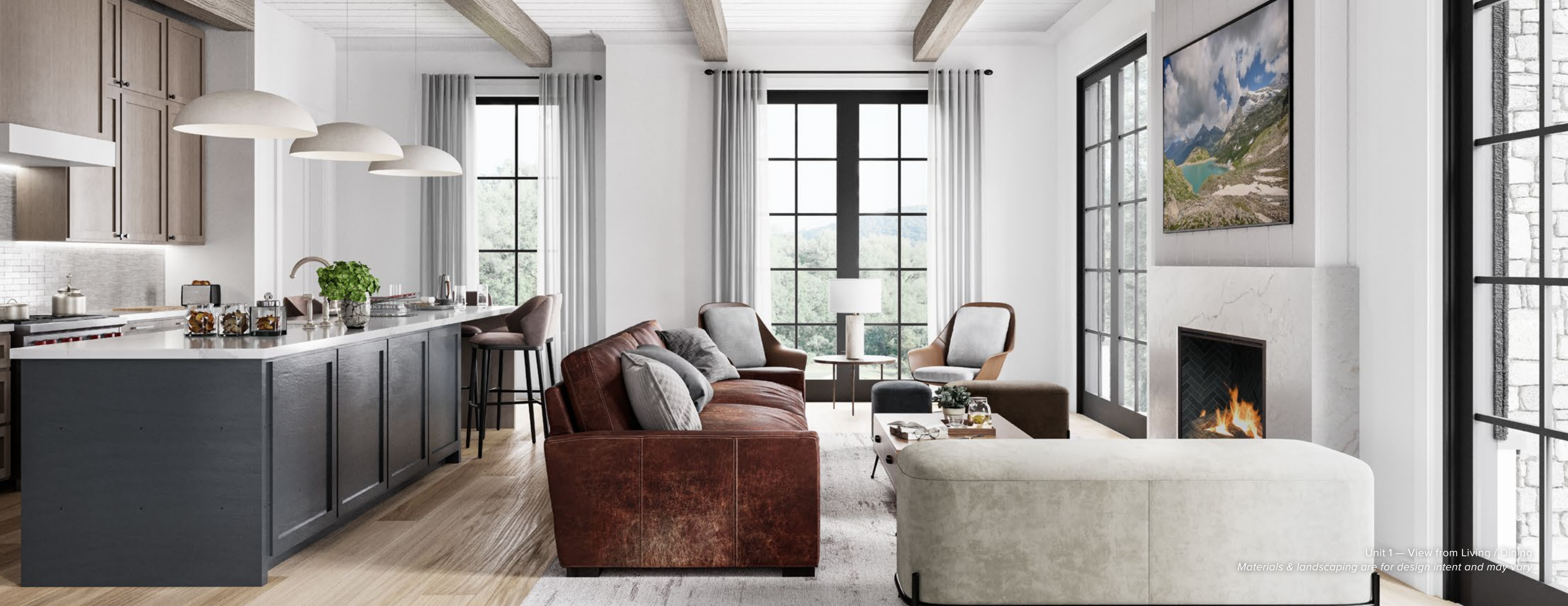
Unit 1 — View from Living / Dining Materials & landscaping are for design intent and may vary