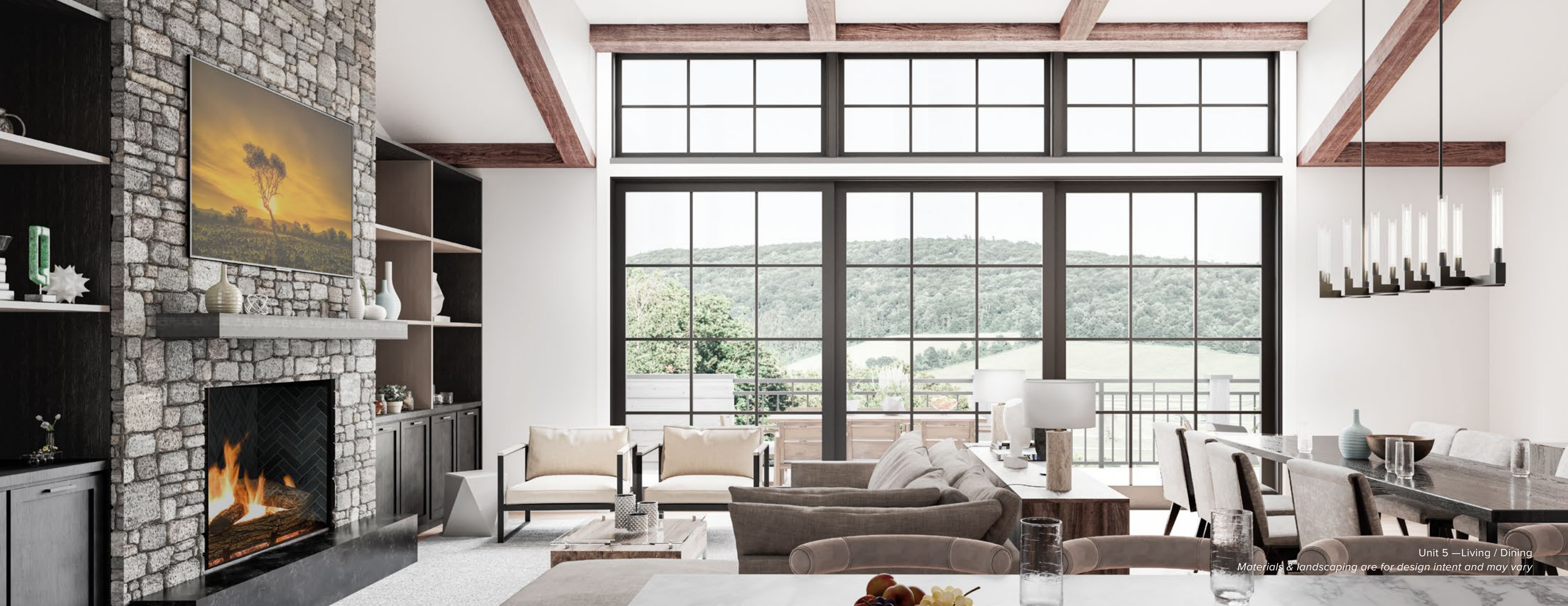
Unit 5 —Living / Dining Materials & landscaping are for design intent and may vary