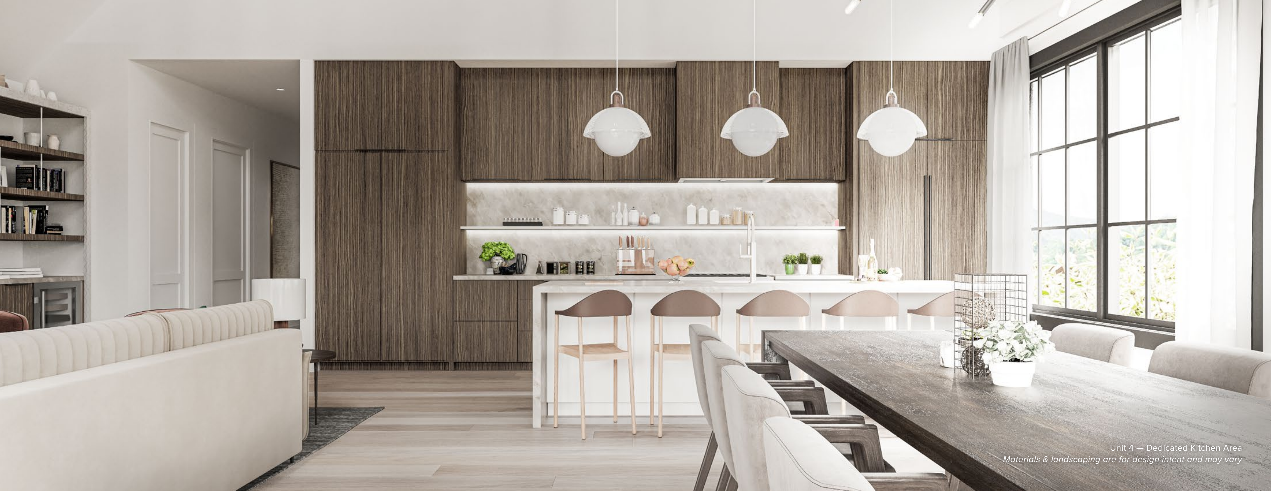
Unit 4 — Dedicated Kitchen Area Materials & landscaping are for design intent and may vary