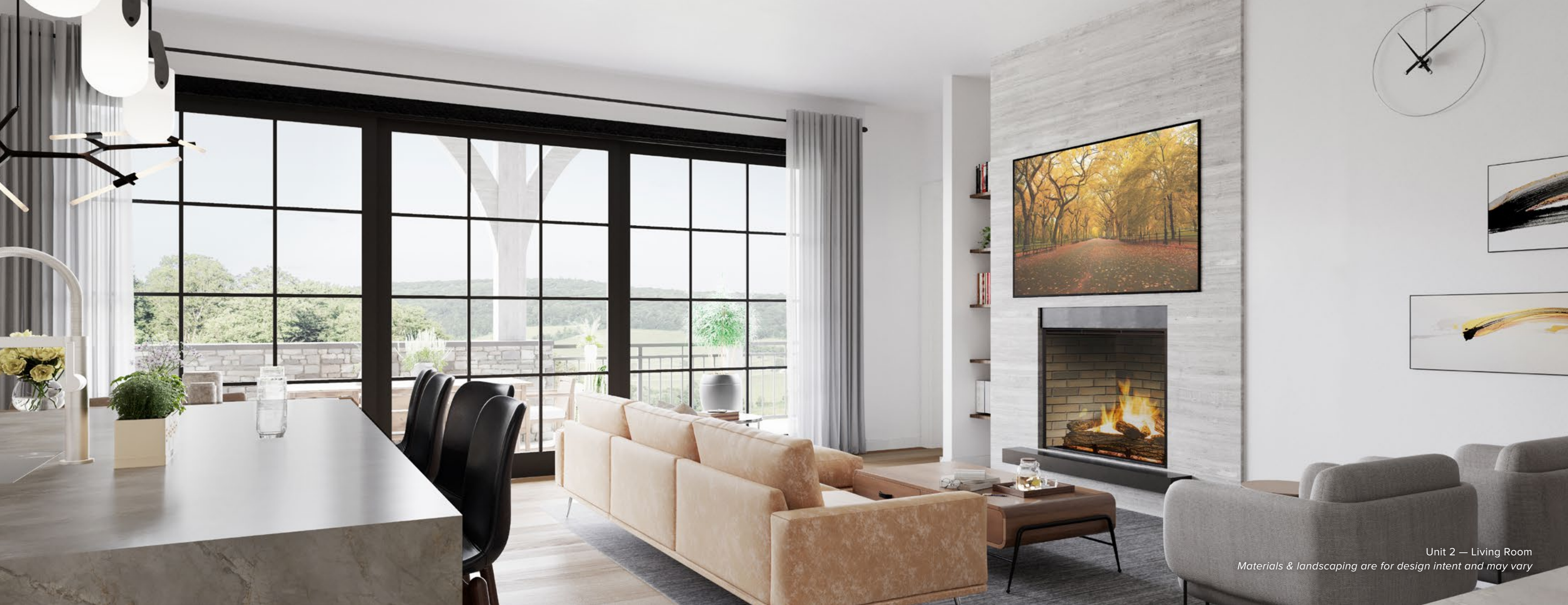
Unit 2 — Living Room Materials & landscaping are for design intent and may vary