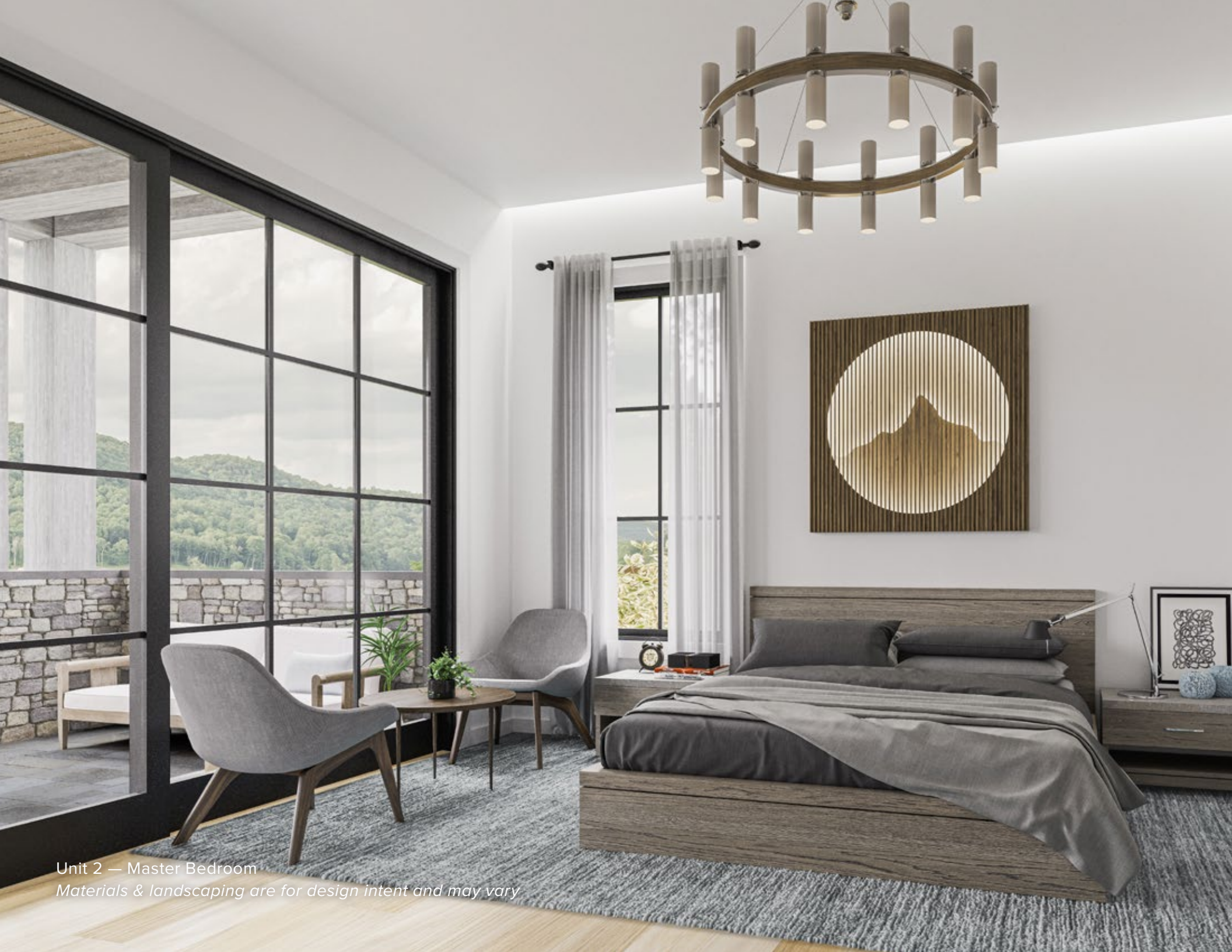
Unit 2 — Master Bedroom Materials & landscaping are for design intent and may vary