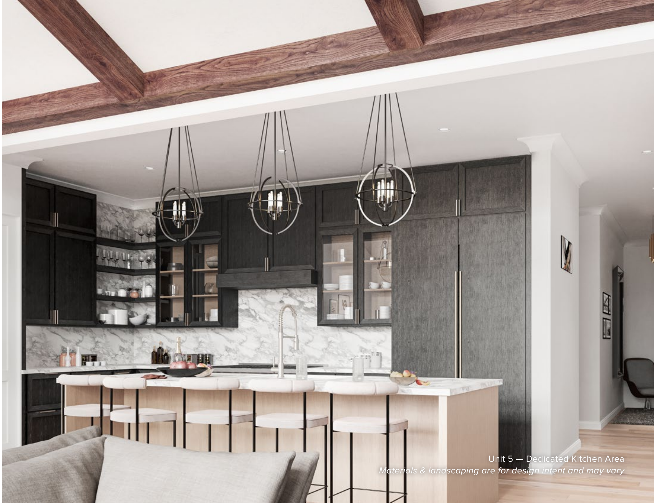
Unit 5 — Dedicated Kitchen Area Materials & landscaping are for design intent and may vary