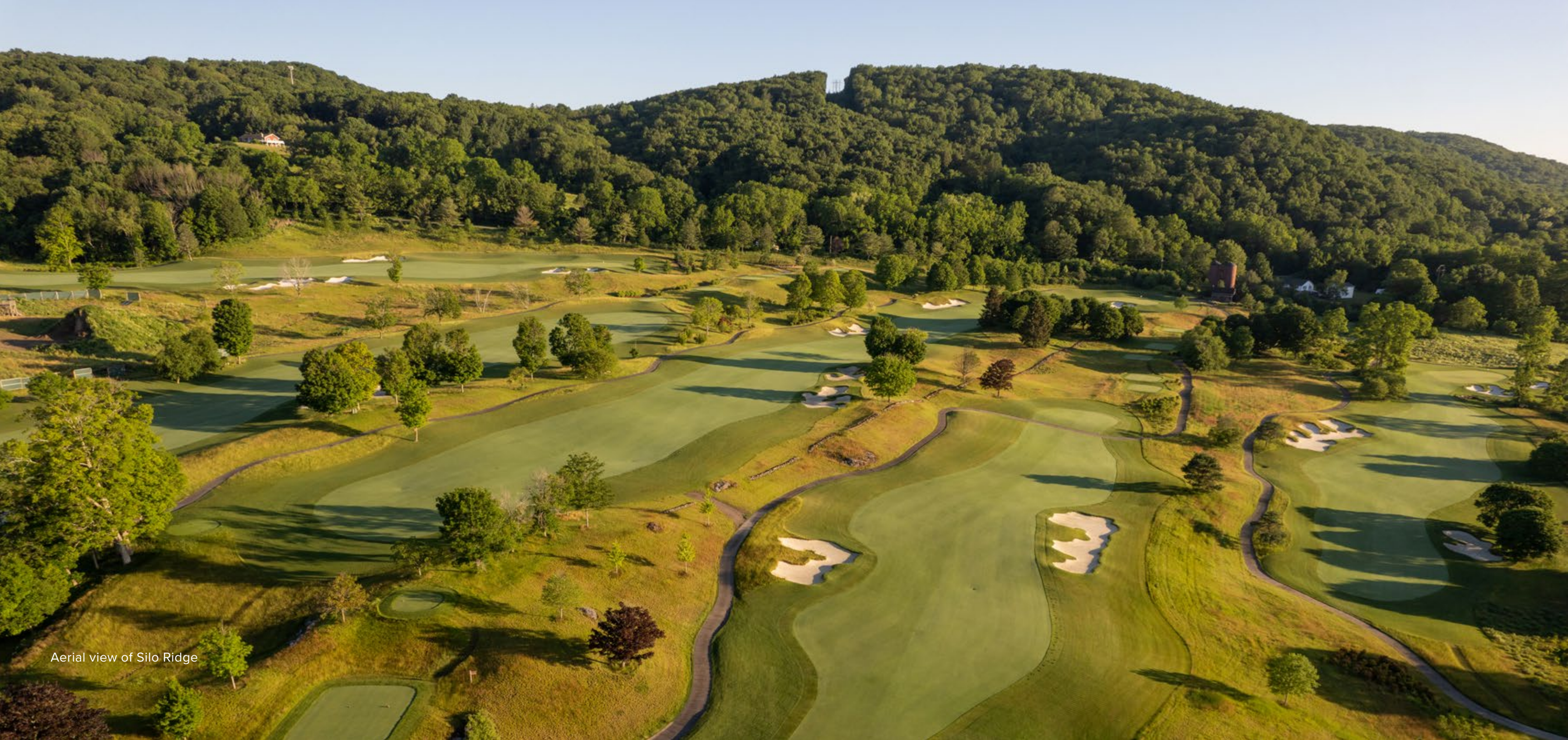
Aerial view of Silo Ridge

For more information about this property and its pricing please contact Silo Ridge Realty.